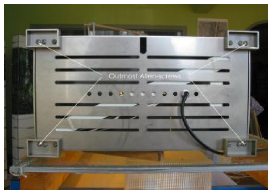
Figure 9 - Allen-screws to free the pedestal plate

c) Remove the four outermost Allen-screws (figure 9). The pedestal plate can now be pulled out and flipped open. Caution: The pedestal plate is hardwired!