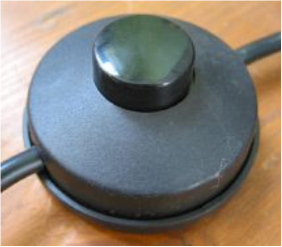
Figure 1 - Foot pedal

3. Turning the light on and off, and the continuously variable luminosity (dimming) are controlled using the foot pedal (figure 1).